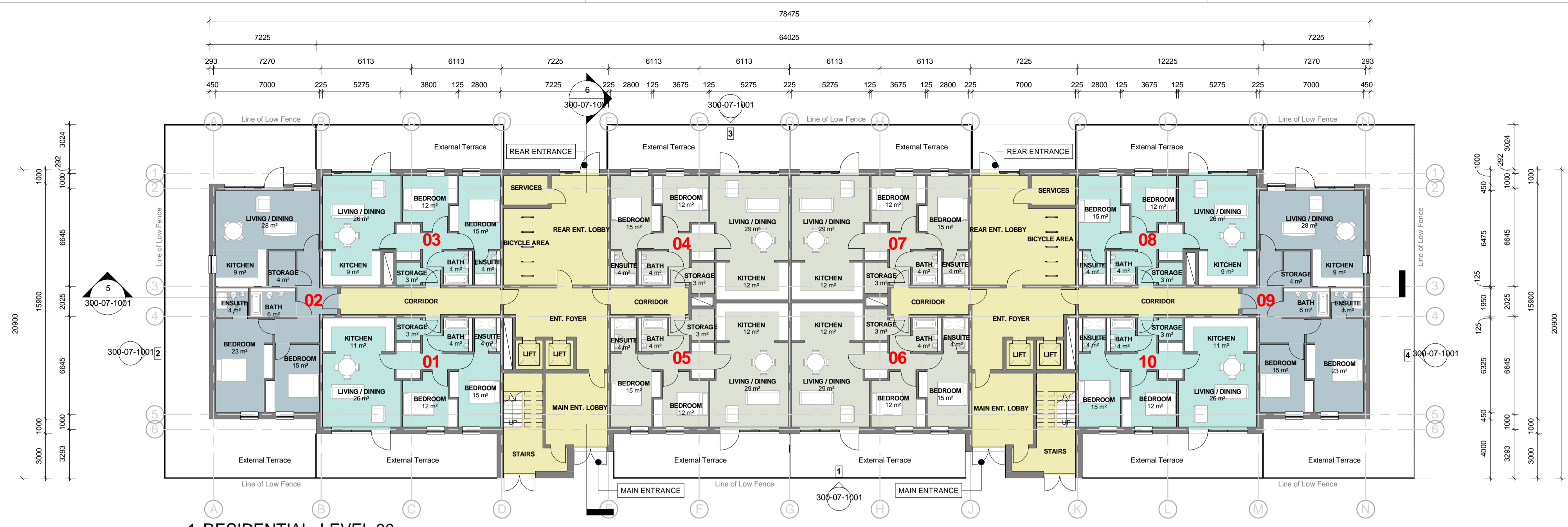
1-RESIDENTIAL LEVEL 00 1 : 200