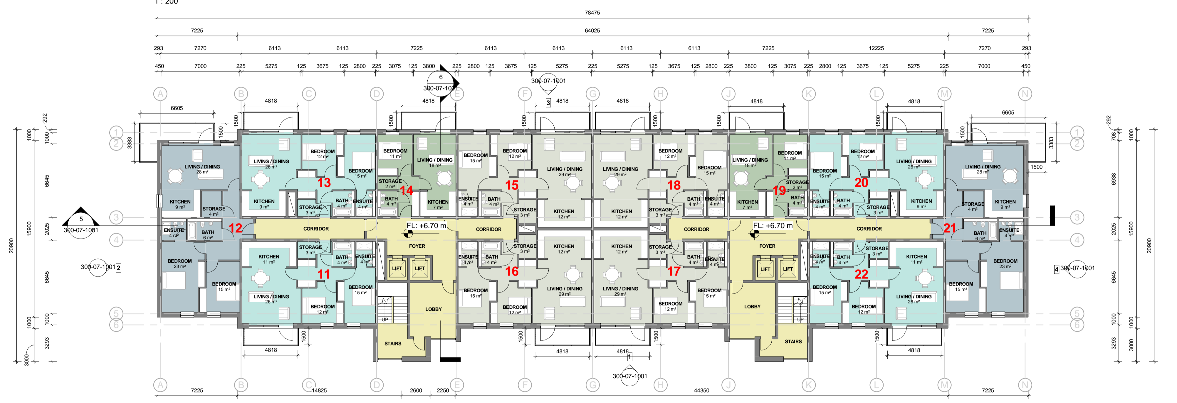
2-RESIDENTIAL LEVEL 01 1 : 200